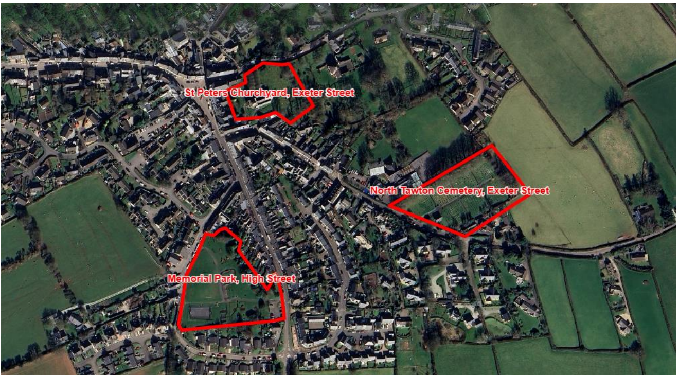
Figure 1 is an aerial image taken from Google, which illustrates the Site (red boxes) in relation to the wider local environment.