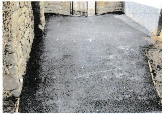
Image showing path toward west gate