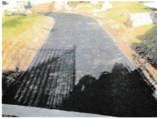
Image showing path from south gate

Photograph's showing completed repairs to church paths 2022