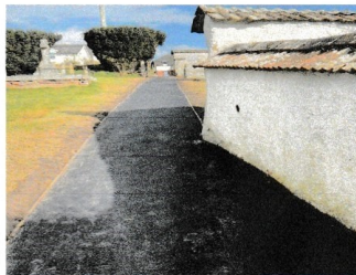
Image showing path to north gate.